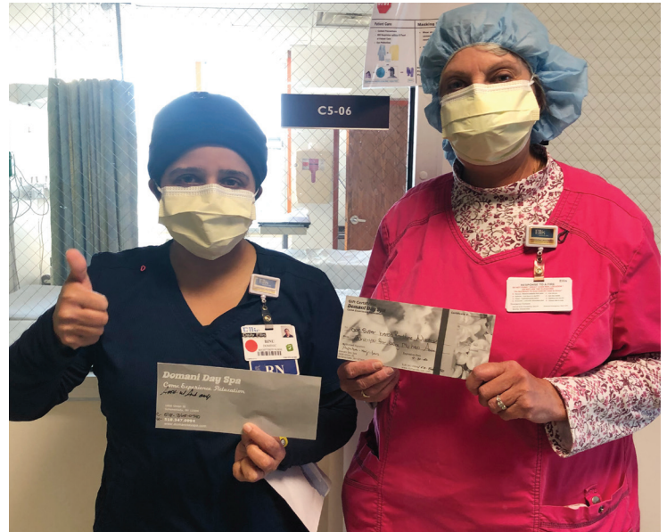
Domani Day Spa donated gift certificates to COVID care teams to thank them for their life saving work.