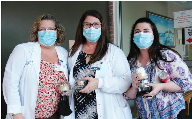
Mohawk Honda & Mohawk Chevrolet donated treats from Cookie Therapy for the COVID care teams