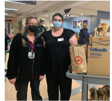
Lunch was sent for the COVID care teams by a thoughtful family in our community.