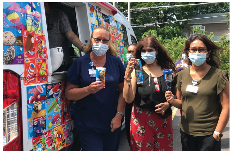
Ellis employees enjoy donated ice cream.