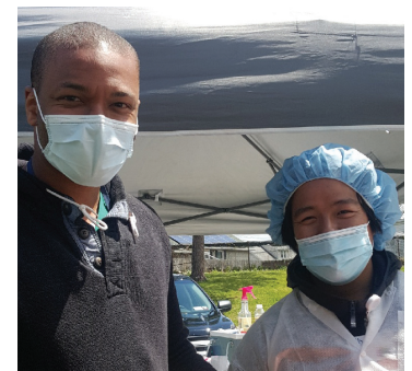
Ellis staff wear PPE at a community testing site. Donations helped keep our teams and patients safe.