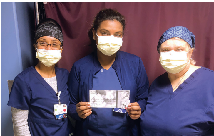
Members of the COVID care teams are appreciative and looking forward to some much needed pampering thanks to manicure gift certificates.